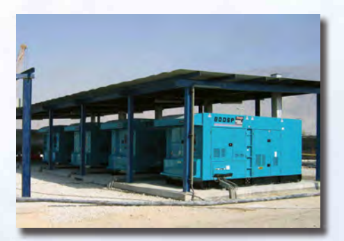
As the power source in the area where electricity is unavaiable.

as are also employed in various facilities as emergency power source for critical equipment like medical equipment in hospital, bank online system and traffic signals etc.